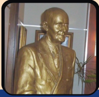
PAUL HARRIS FOUNDER THE ROTARY ORG